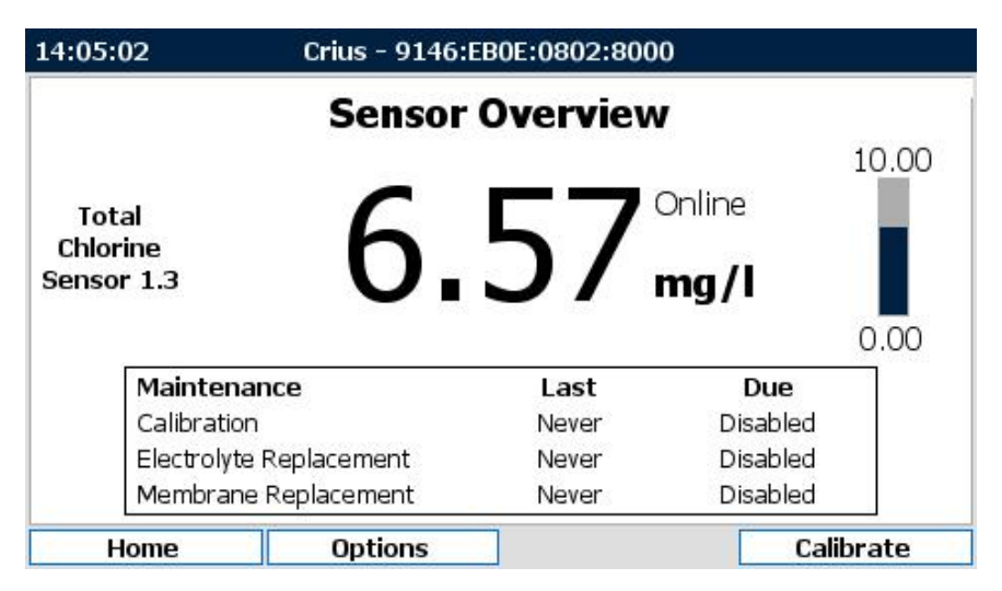
Chlorine Screen Overview